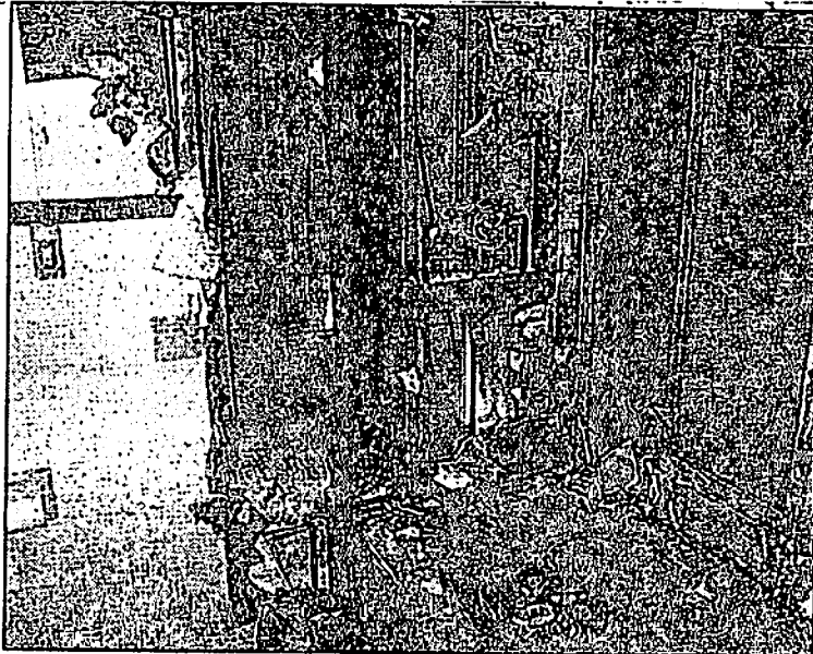
The fire rose from the garage into the bathroom and firefighters were forced to rip down the wall.